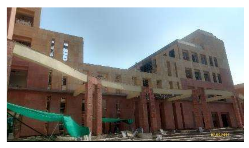
Food Court, Restaurant and Accommodation